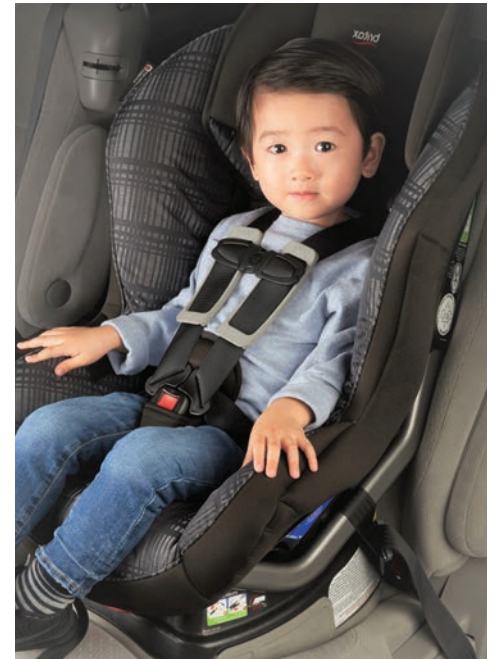
Child seat installed forward-facing